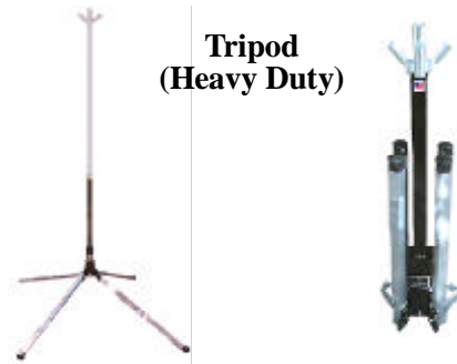
Tripod (Heavy Duty)