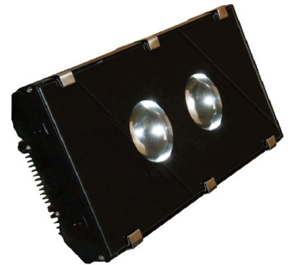
TBFLOOD-LED-140W-120VAC & TBSPOT-LED-140W-120VAC