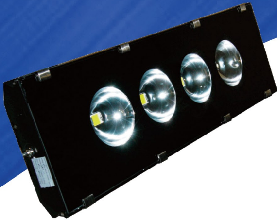
TBFLOOD-LED-200W-120VAC & TBSPOT-LED-200W-120VAC