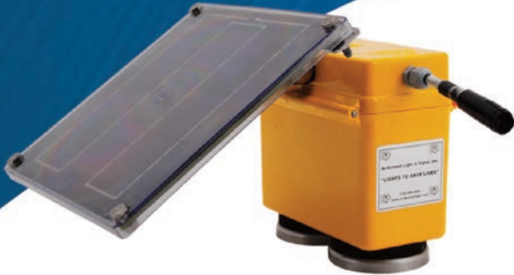
BP - 888 - NMH - 12V SOLAR-POWERED BATTERY PACK

All Lights Meet D.O.T. Intensity Requirements CF33 Part 66 Code of Federal Requirements