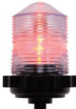
9P 1/2 PIPE MOUNT